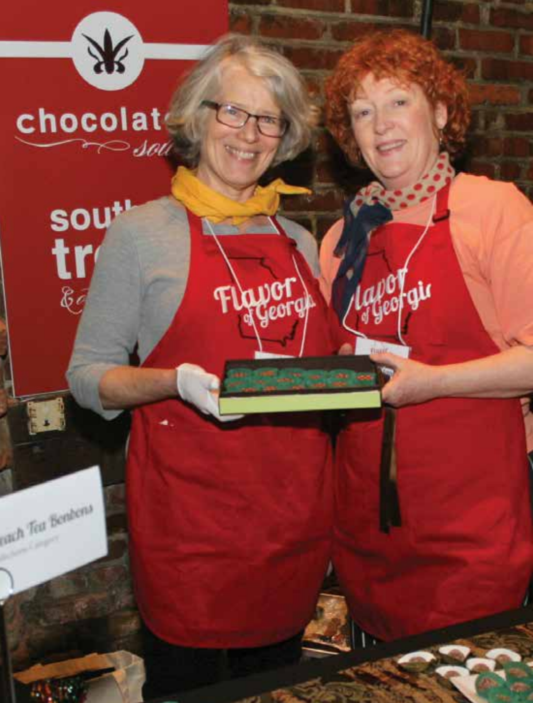
2013 Flavor of Georgia winner Chocolate South, Peach Tea Bonbon